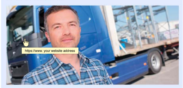
Caption to your sponsored post image here