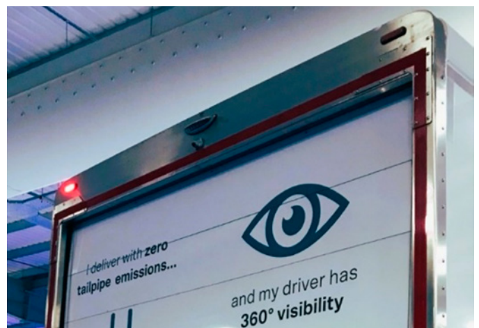
Fig 3: Outline marker lamp

79% of all vehicle lamp failures, and 83% of all trailer lamp failures are due to an obligatory lamp missing or inoperative.