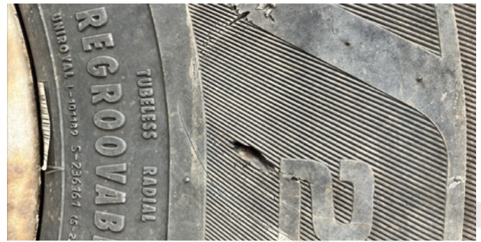
Fig 8: Tyre wall damage

Age of tyres: You should try to identify the age marking of all tyres and note this on records. No tyre over the age of 10 years can be fitted to the front steered axle of a HGV. See fig 9.