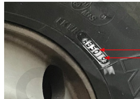
Fig 9: Tyre date markings