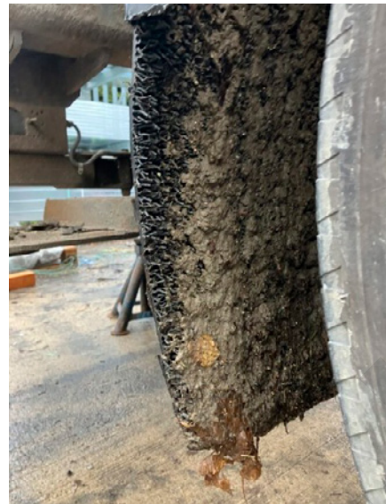
Fig 11: Spray suppression

Cleanliness: For spray suppression to perform adequately it must be maintained in a reasonably clean state. Ensure that the cleaning of a vehicle for inspection includes the spray suppression. To do this effectively, this will usually require the use of a high-pressure jet washer.