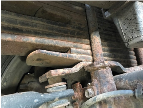
Fig 7: Broken spring

And for trailers the main items are air suspension, valves, pipes and bellows: