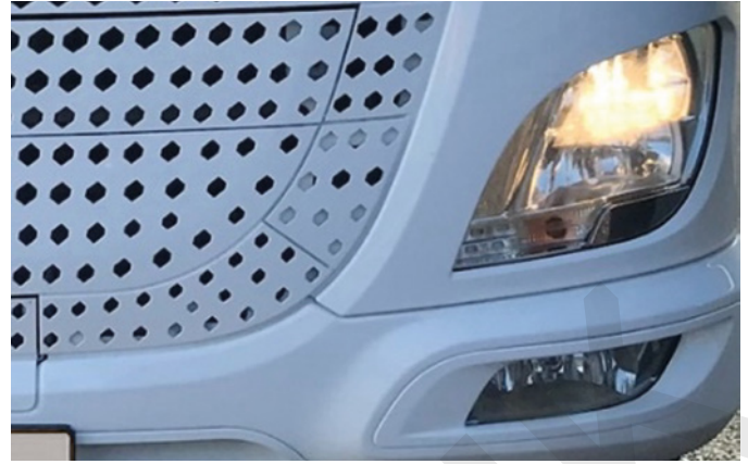
Fig 2: Headlamp

Always check the vehicle's headlamps in the same condition as it will be presented for MOT. For example, if it is to be loaded for test, check it in its loaded state. Ensure the suspension has settled – this may require some dynamic braking events. Ensure staff are competent with operating the testing equipment and are able