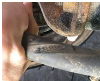
Fig 5: Damaged brake hose

Additionally, 19% of trailer braking system and component defects are due to an ineffective, insecure or missing locking device on a brake rod/linkage/slack adjuster, etc!