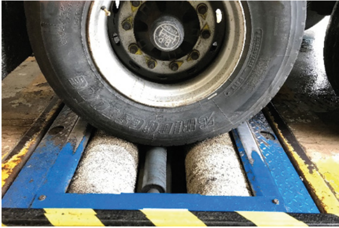
Fig 1: Roller brake tester

The other main 'service brake performance' defect is for major imbalance (failing to achieve 70% of the brake effort of the other wheel across an axle). For vehicles this accounts for 28% of all 'service brake performance' defects, and for trailers it's 15%.