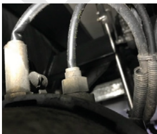
Fig 4: Kinked brake pipe

Damaged or deformed flexible hoses, or excessively corroded brake pipes, account for 16% of all vehicles, and 12% of all trailer, braking system and component defects. With 11% of vehicles and 19% of trailer braking system defects being for air leakage at those components.