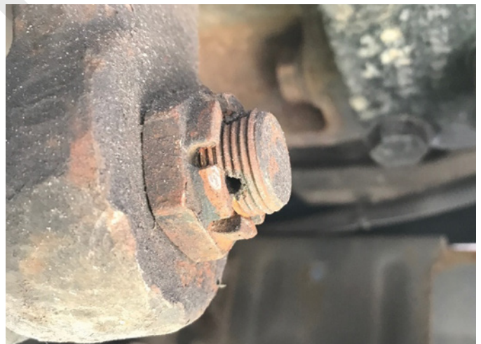
Fig 6: Missing split pin

Condition of components: As with the guidance above, components need to be reasonably clean for a meaningful evaluation to be made of their condition.