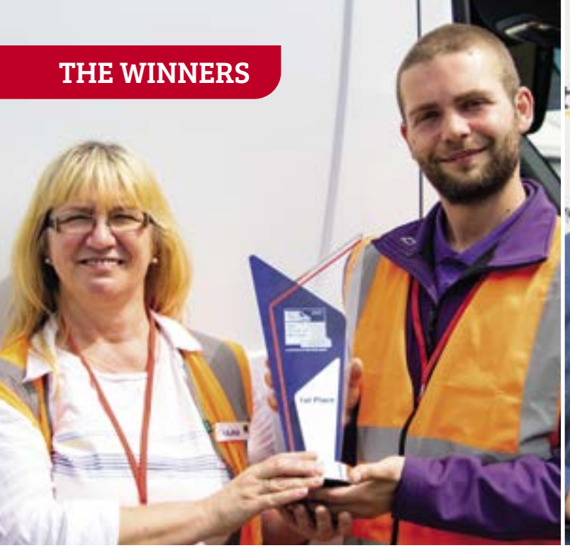
Cuartix Radical Business Planting TVL Sec